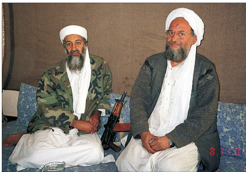
Osama bin Laden (left) and Ayman al-Zawahiri (right) photographed in 2001.

As the Taliban lost its stranglehold on major portions of Afghanistan, its fighters withdrew to the mountainous wilds in the borderlands with Pakistan, where the organization could regroup and mount an insurgency into Afghanistan. Osama bin Laden evaded capture in Afghanistan, and removed himself and much of the leadership of al-Qaeda to Pakistan. For some time, bin Laden and members of his family lived in seclusion in the city of Abbottabad, in a walled villa only a short distance from the