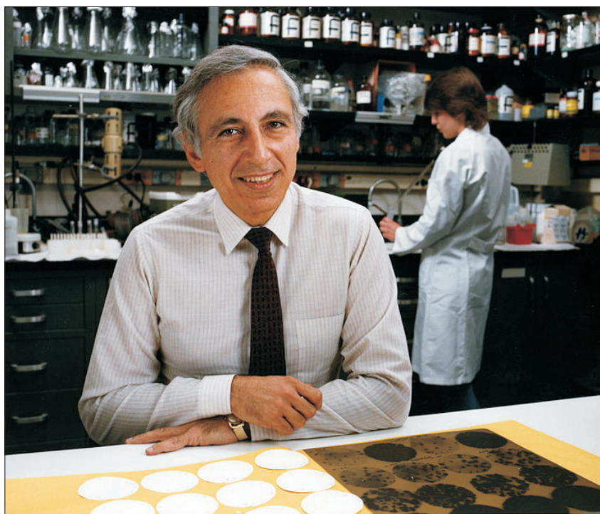
Robert Charles Gallo.

In 1981, clinical descriptions of a new disease among sexually active, gay men, blood transfusion recipients, and intravenous drug abusers appeared. This disease was characterized by a complete breakdown of the immune system and was named acquired immunodeficiency syndrome, or AIDS. In 1981, Gallo attended a seminar by Centers for Disease Control epidemiologist Jim Curran, who spoke about the advancing AIDS epidemic and asked the audience, “Where are the virologists?” Curran was convinced