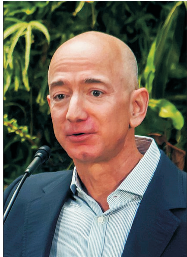
Jeff Bezos.

Amazon.com, also known simply as Amazon, was founded as an online bookstore by Jeff Bezos in 1994. Bezos named the company after the Amazon river in South America—considered the biggest river in the world—to reflect his goal of creating the largest bookstore in the